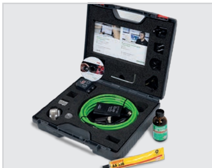
FAG SmartCheck Service Kit