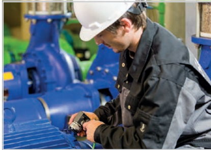
Use of the measurement system on, for example, motor, pump, fan